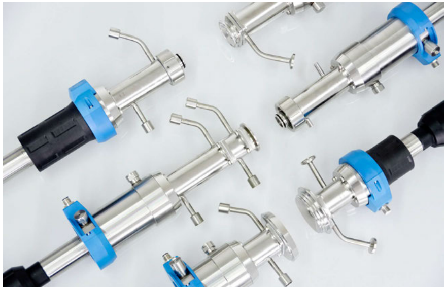
Numerous connection options for any installation situation.