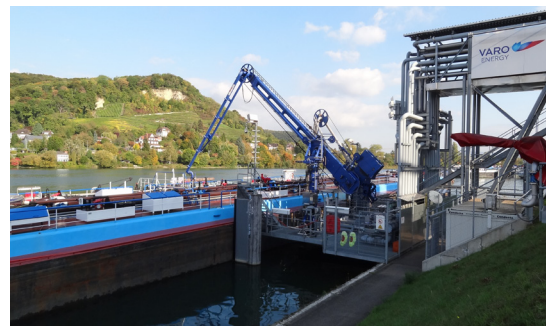
Unloading a ship in the Rhine port of Birsfelden

Approximately 250 tankers dock here each year at the two mooring stations located at VARO Energy Tankstorage AG in the Rhine port of Birsfelden. Endress+Hauser's flowmeter system has made it possible to speed up the unloading process and to record the load volume accurately and in real-time during unloading.