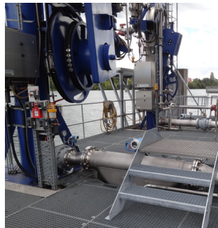
Promass 84F at an unloading system