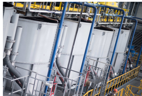
Mining project Kyzyl in the North-West Kazakhstan

In a challenging mining environment, one of the main tasks of the companies is maximizing operational availability. The use of reliable Endress+Hauser instrumentation helped Bakyrchik Mining Venture to optimize the mine drainage process and reduced ore extraction downtime.