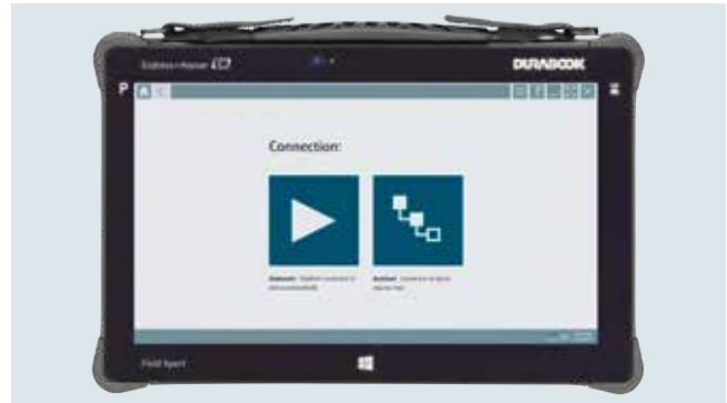
Field Xpert SMT70