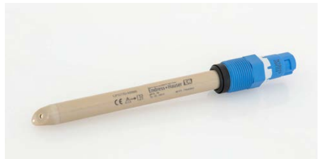
Non-glass pH sensor CPS77E