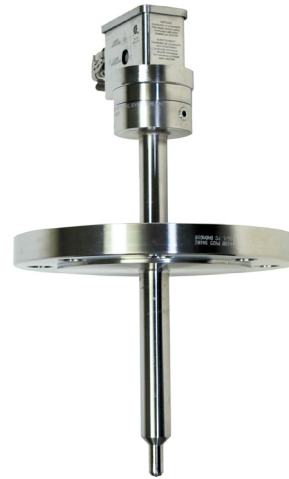
Rxn-41 fiber optic probe