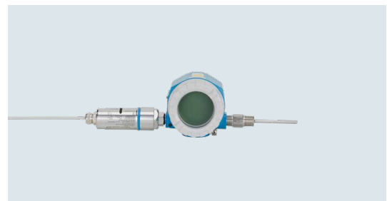
FieldPort SWA50 with iTemp (temperature), direct mount