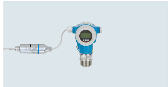
FieldPort SWA50 with Cerabar (pressure), remote mount