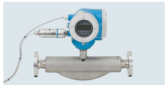
FieldPort SWA50 with Promass (flow), direct mount