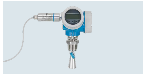
FieldPort SWA50 with Micropilot (level), direct mount